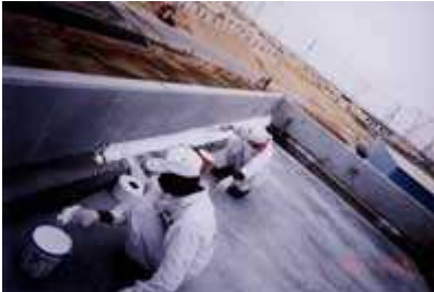
Taping the joints