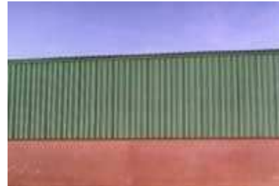
Thermo-Shield Roof and Wall Coatings waterproofing and insulating.