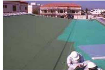
A villa in Jumeirah for Engineers Office (EO), Dubai. Thermo-Shield® Roof Coat in green color.