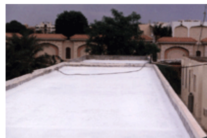
Sheikh Khalifa's Palace in Al Ain - Thermo-Shield® waterproofing and insulating.