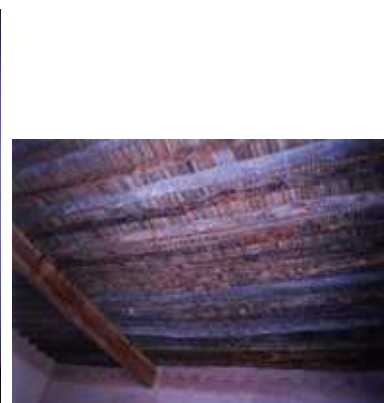
Samalyah Island Heritage Project for Sheikh Sultan Bin Zayed. Thermo-Shield® Wood & Deck and Exterior Coats protecting woods and steel.