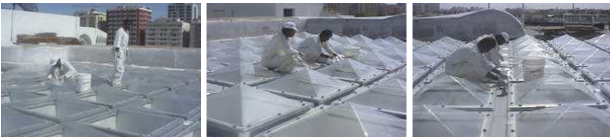
Thermo-Shield® Roof Coat on VIP roof of PWD – Abu Dhabi