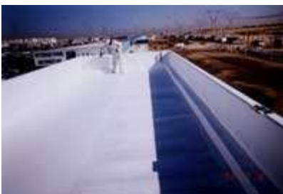
Finishing Last Coat