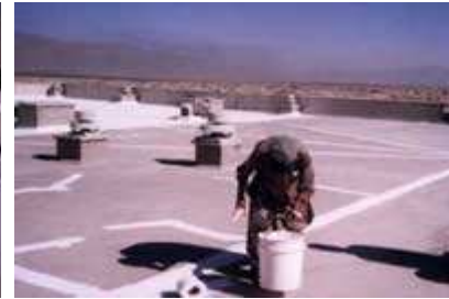
Sheikh Khalifa Hospital Complex in Quetta. Thermo-Shield® Roof Coat waterproofing and insulating.