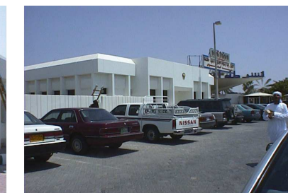
UAE Gen. Directorate of Police Control Building, Abu Dhabi, Thermo-Shield® waterproofing and insulating roof and walls.