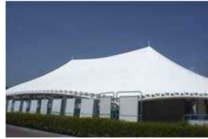
Concrete gazebo at Sheik Moh. Bin Rashid sister's villa in Jumeirah, Dubai - Thermo-Shield® Roof Coat.