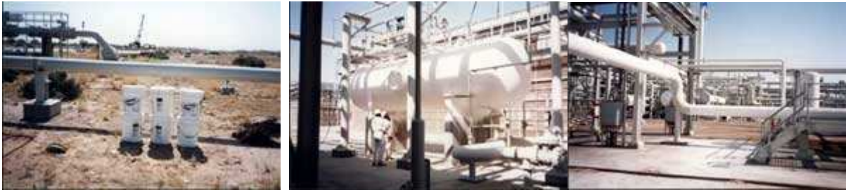
Thermo-Shield® Coating for BP Amoco at the Sajaa Plant in the UAE