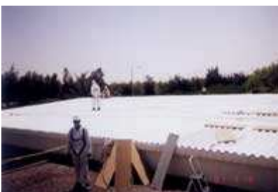
Dubai Training Workshop – asbestos roof coated with Thermo-Shield® Roof Coat