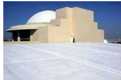
Dubai International Bowling Federation; Thermo-Shield® Roof Coating waterproofing and insulating.