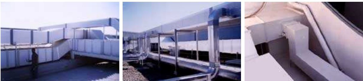
Thermo-Shield® Coating on A/C Ducts – Sharjah City Center and Al Ain Camel Race Track – UAE