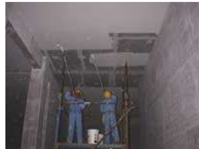
Sheikh Zayed Bin Sultan II Grand Mosque, Abu Dhabi. Thermo-Shield® on mechanical tunnels.