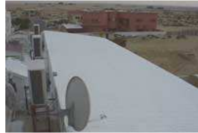
Yaqoob Villa Complex in Mirdif, Dubai. Thermo-Shield® Roof Coat insulating and waterproofing.