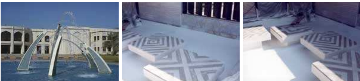
Thermo-Shield® Coatings on flutes (HTC – Abu Dhabi) and waterproofing a fountain (Bateen Palace – Abu Dhabi)