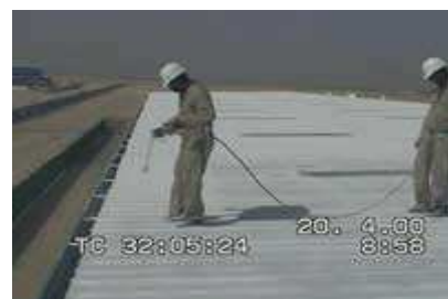
Kaddas Oil Field Services, Thermo-Shield® Roof Coat waterproofing and insulating, Jabel Ali, Dubai