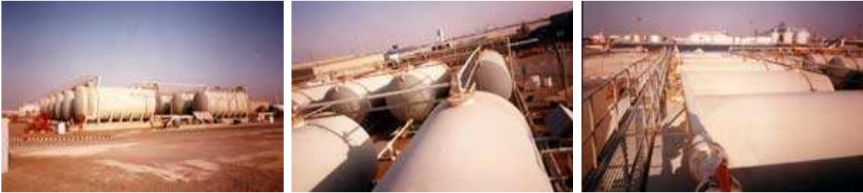
Thermo-Shield® Coating on Hydrochloric acid tanks - Hal Chemicals at Jabel Ali – Dubai