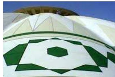
Al Rahba New Medical Center Administration Building; Thermo-Shield® Roof Coat as insulation and waterproofing – Abu Dhabi