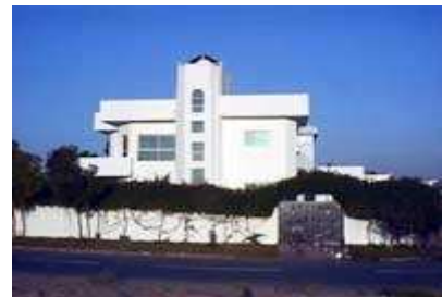
Dr Mohammed Asoomi's Villa in Mirdif, Dubai; Thermo-Shield® Exterior Wall Coating (including boundary wall).