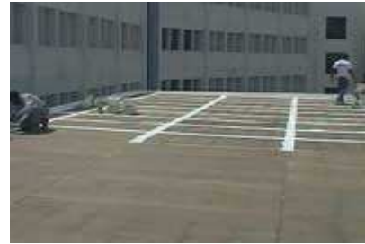
New Office of the Head of Minor Projects (Abu Dhabi PWD). Plywood roof and cement board walls