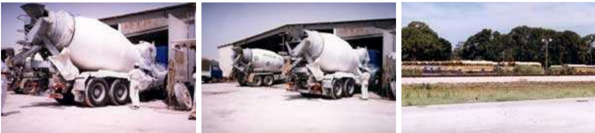
Thermo-Shield® Coating on cement mixer (UAE) and school buses (USA)