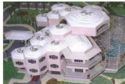
Abu Dhabi Crowned Prince's new villa at Bateen Palace. Thermo-Shield® Roof Coating waterproofing and insulating.